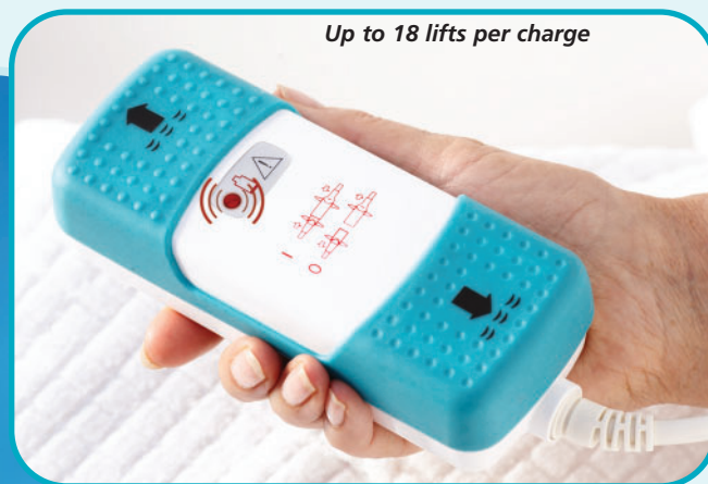
Up to 18 lifts per charge