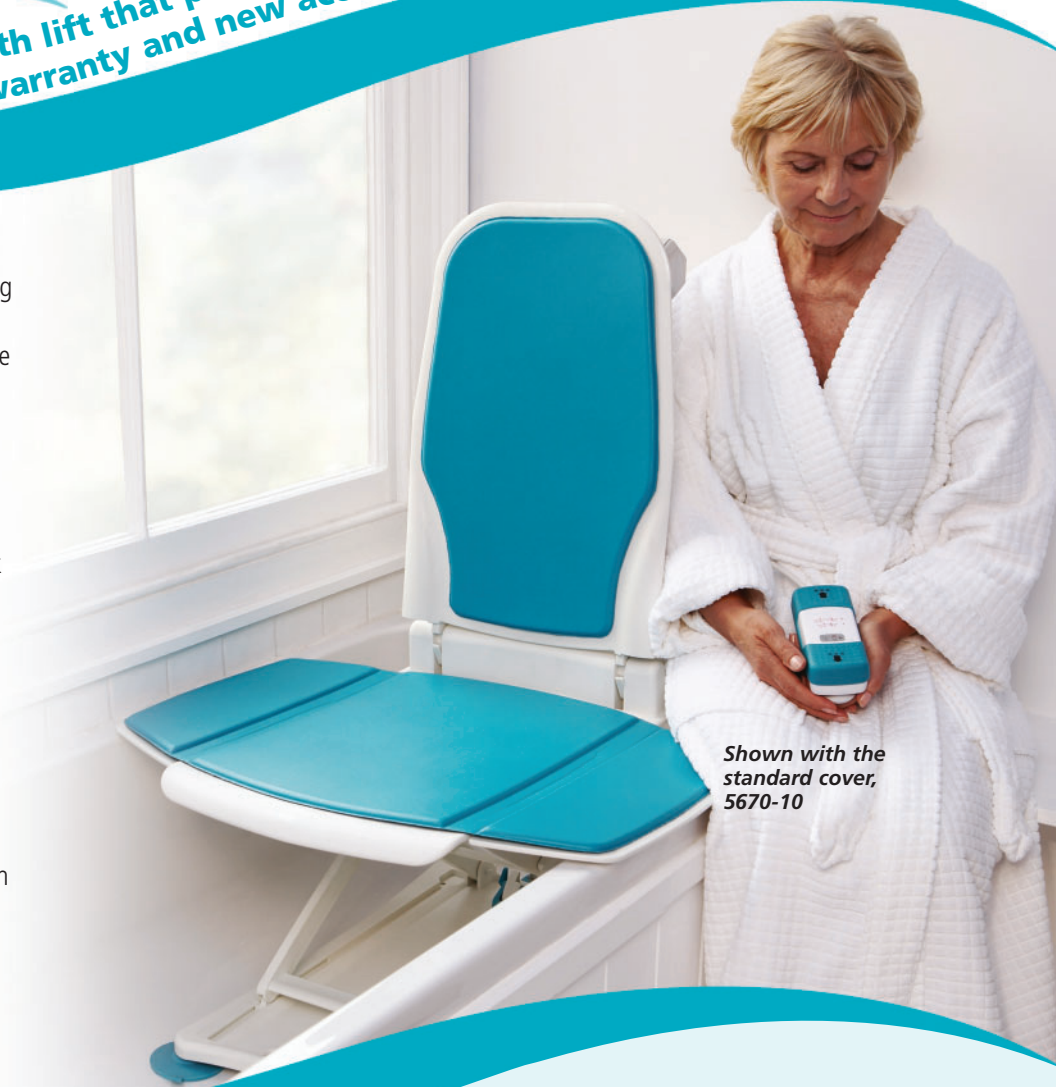
Shown with the standard cover, 5670-10