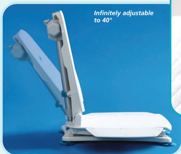
Infinitely adjustable to 40°