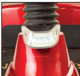
Front and rear lights and side reflectors for safety