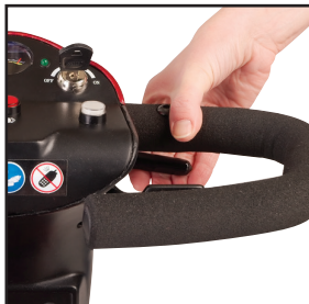
User-friendly auto-tiller adjustment