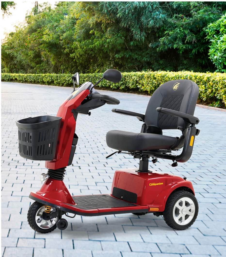
Shown with Power Elevating Seat