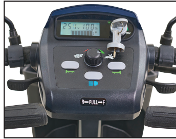
Digital Dashboard & User-friendly auto-tiller adjustment

2 Electronics warranty excludes batteries.