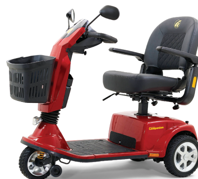
Shown with Power Elevating Seat