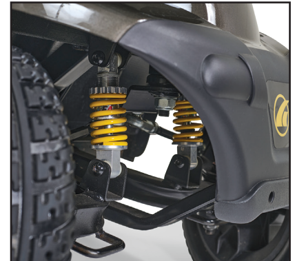
Front and rear suspension for a smooth ride