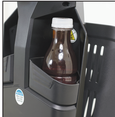
Conveniently located drink holders