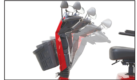
Infinite adjustable tiller with ergonomic design